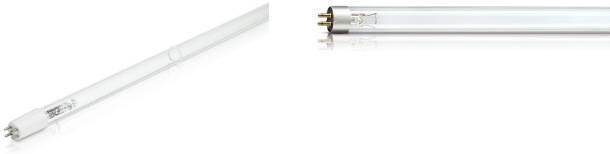
4 pins single ended